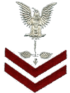
Aviation Anti-Submarine Warfare Technician