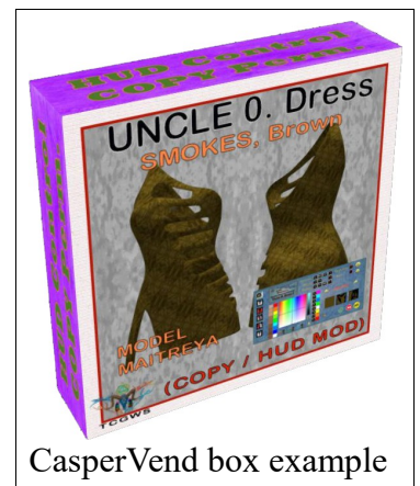
CasperVend box example

The following diagram points out the areas on the HUD.