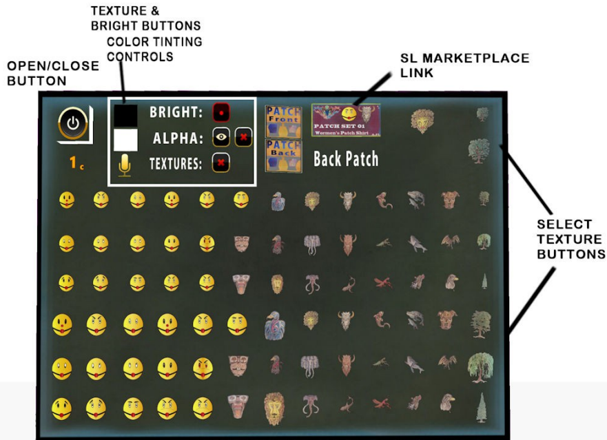
HUDs and call-outs.

Hit the open/close button to close and reopen it so