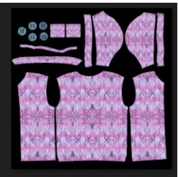
HUDc.Mens Open Shirt.Fractal 1st Burns, Brazil Dark-Violet.jpg

HUDc.Mens Open Shirt.Wood-Red-FBD-Rainbow1.jpg