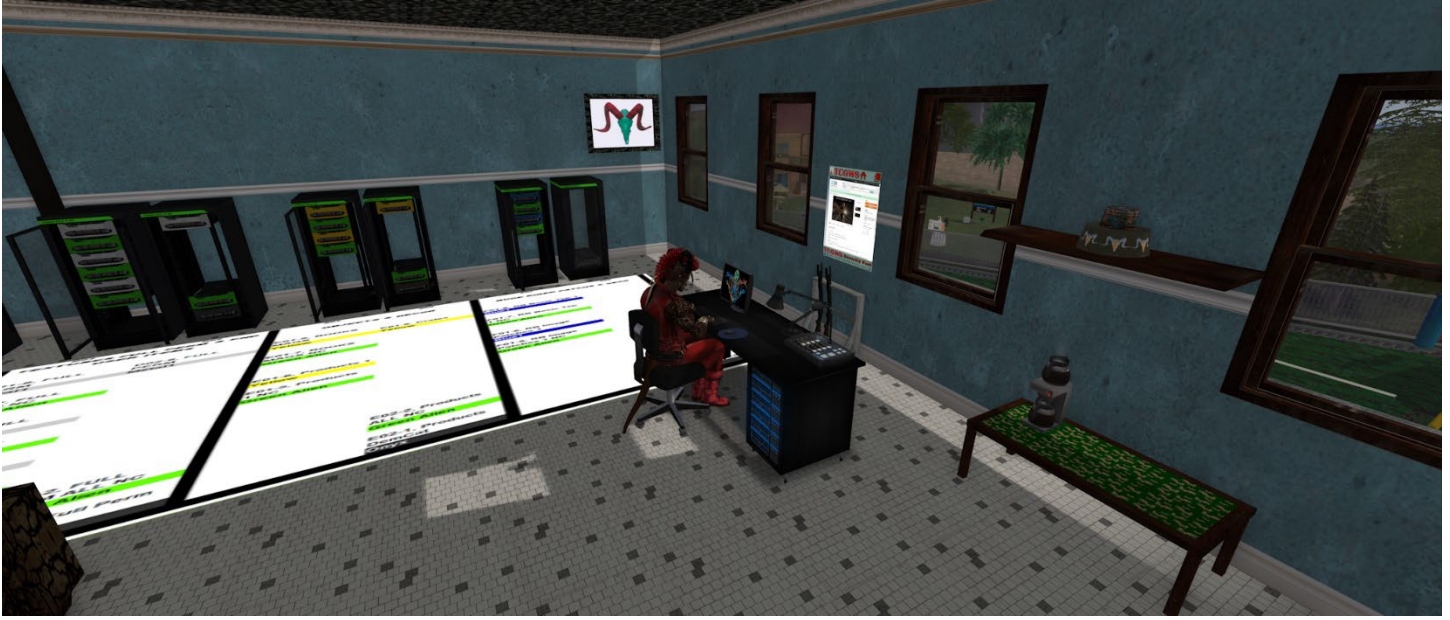
Figure 3: Server Room Office, TCGWS