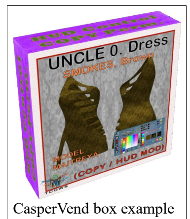
CasperVend box example