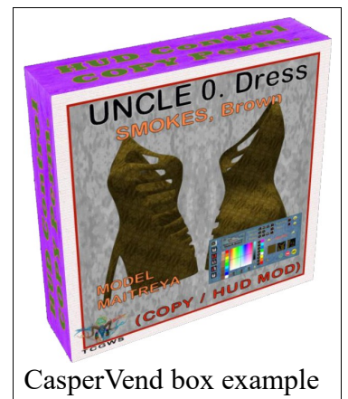
CasperVend box example