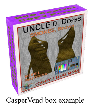
CasperVend box example